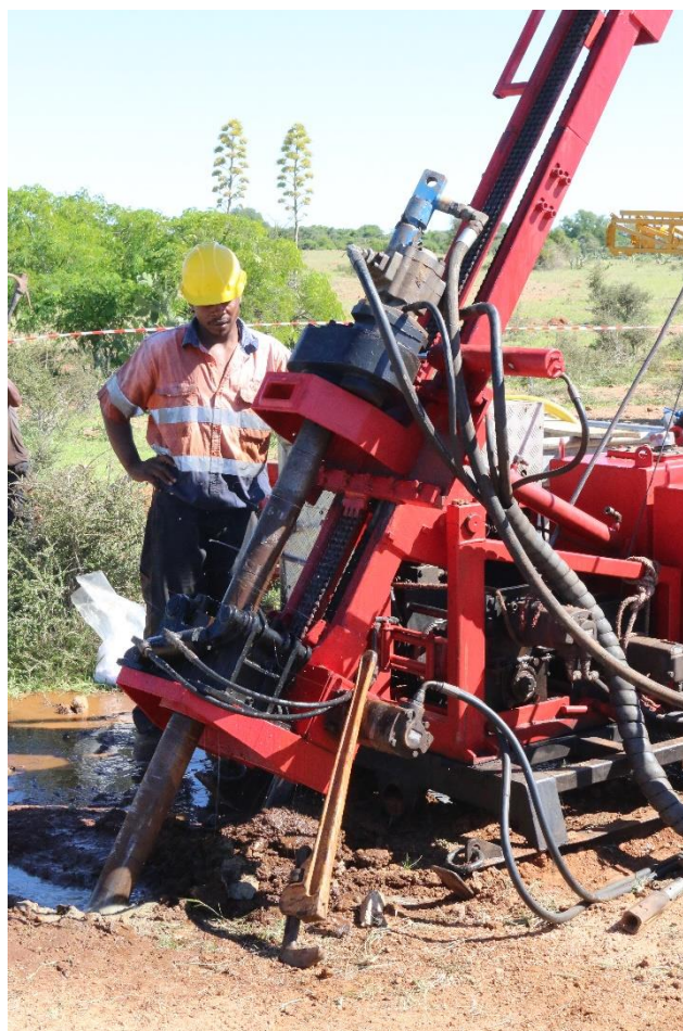
Figure 1 – BEM's first diamond drilling rig in operation at the Maniry graphite project

The Company advises that the first rig has been averaging 25 metres per shift and it is currently expected to drill to a depth of approximately 60-70 metres for each hole. The second rig is due to be commissioned this week. The Company plans to run the 2 rigs for its initial 200 hole program comprising 10,800 metres and the drill program has been designed to enable the Company to define a maiden JORC Resource currently targeted for mid-2018.