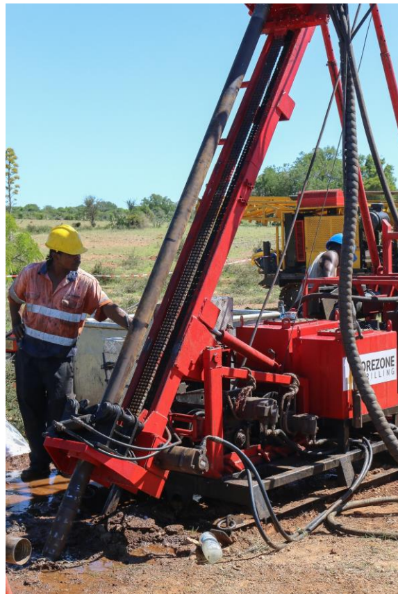
Figure 2 – Drilling continues at BEM's Razafy Prospect (Maniry)