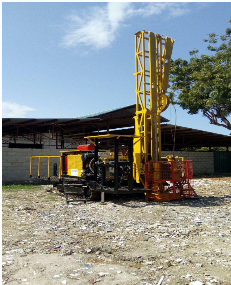
Figure 1 - One of the drilling rigs mobilised to the Maniry graphite project

Further, the Company advises that the 2 rigs to be used have been mobilised to arrive at the Maniry graphite project next week. A 200 hole program comprising 10,800 metres has been designed to enable the Company to define a maiden JORC Resource currently targeted for mid 2018.